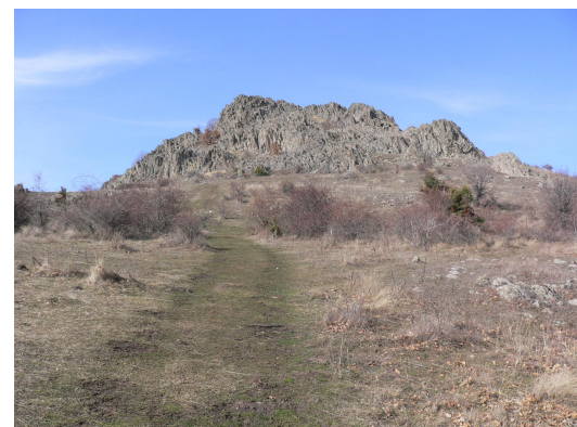
Kokino Observatory in Macedonia

There are other mysteries in ancient astronomy that are not explainable. Ancient Babylonia, Greece, Rome, Asian, India, Islam, and even Native American cultures provide many avenues for investigation in archaeoastronomy. I have only provided three examples of such investigations. There are courses of study in archaeoastronomy being developed in several universities to answer these questions- where have we been and where are we going, and the ultimate question- Are We Alone?